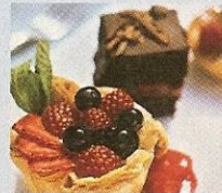
BERRY BOM BOM