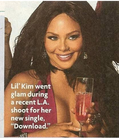
Lil' Kim went glam during a recent L.A. shoot for her new single, "Download."